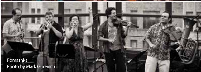
Romashka