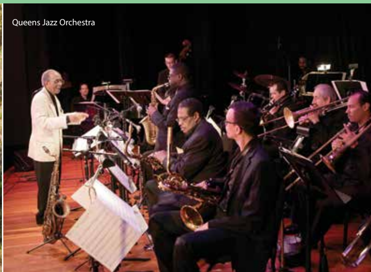
Queens Jazz Orchestra