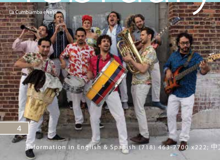
La Cumbiamba eNeYé