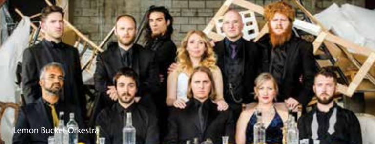
Lemon Bucket Orkestra